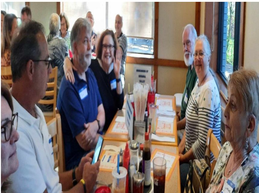
August Dinner Out - 1