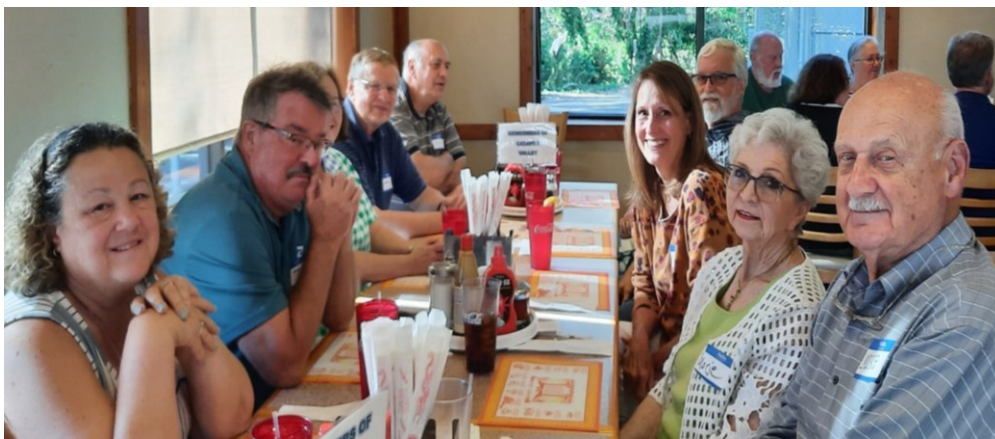
August Dinner Out - 2