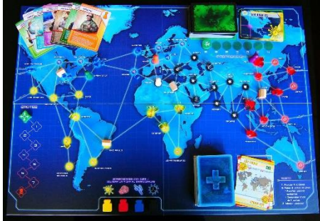
THE PANADEMIC GAME BOARD.