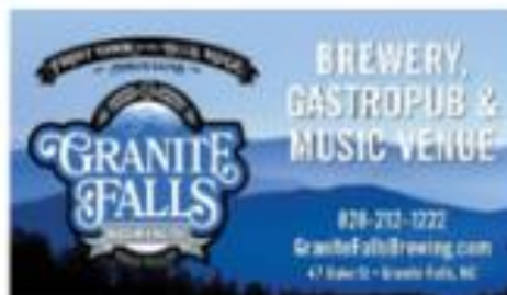
Granite Falls Brewery