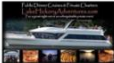
Lake Hickory Adventures