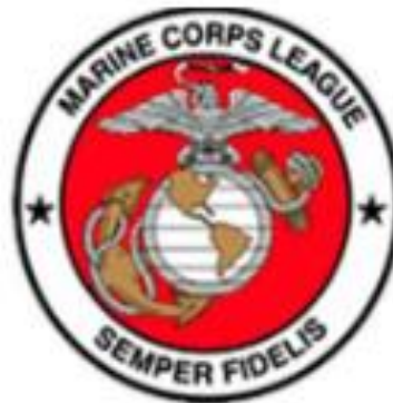
Marine Corps League