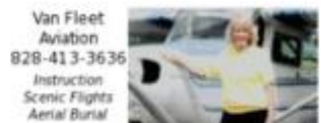
Van Fleet Aviation