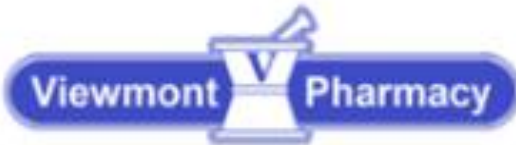
Viewmont Healthsmart Pharmacy