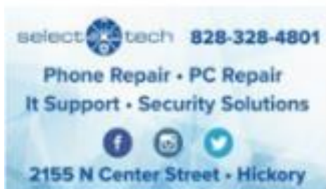
Select Tech Repairs