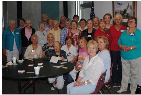
Daytime Canasta Crew